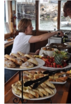
Fresh baked pastries and seasonal fruits