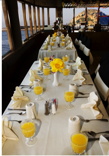
Bottomless Mimosas and spectacular views