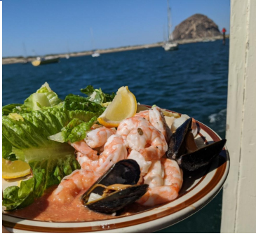
Seasonal locally sourced entrees